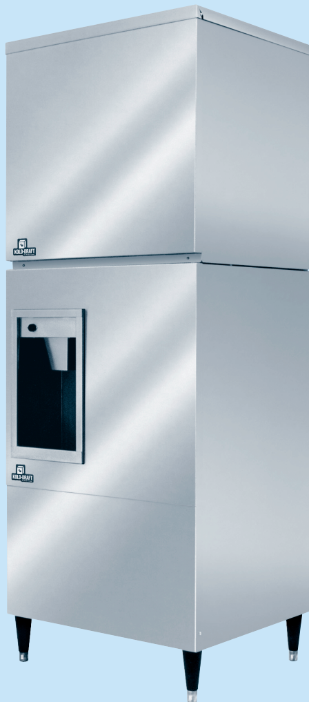
Classic GT550 Series Ice Cuber on an AKD-125 Dispenser on legs.

The AKD-125 features one-hand, push-button dispensing for ease of operation when filling containers and ice buckets. The auger feed mechanism prevents the waste, spillage and splashing problems caused by gravity dump machines.